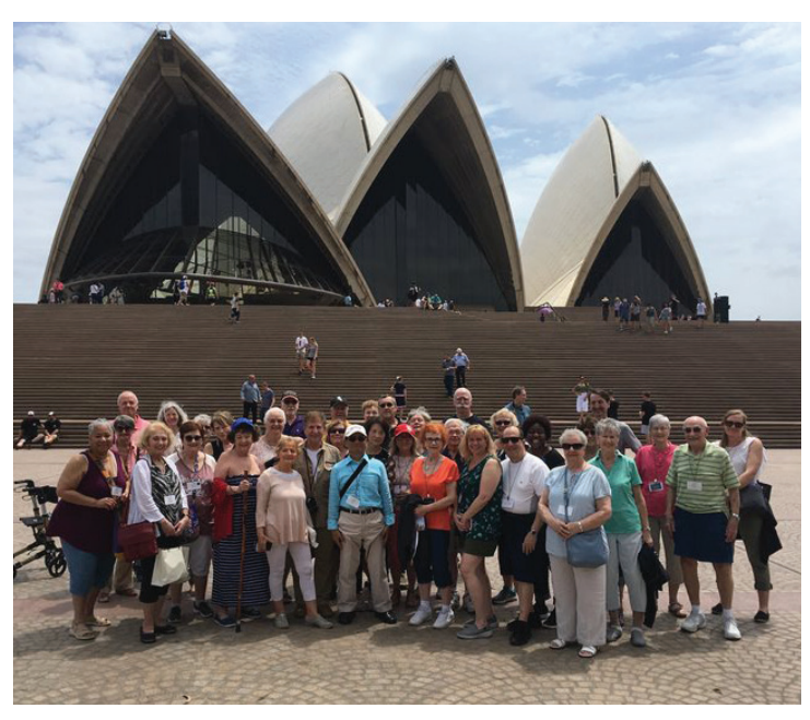
Our Platinum Adventures travelers in front of the Sydney Opera House during the South Pacific Wonders trip in January 2019.