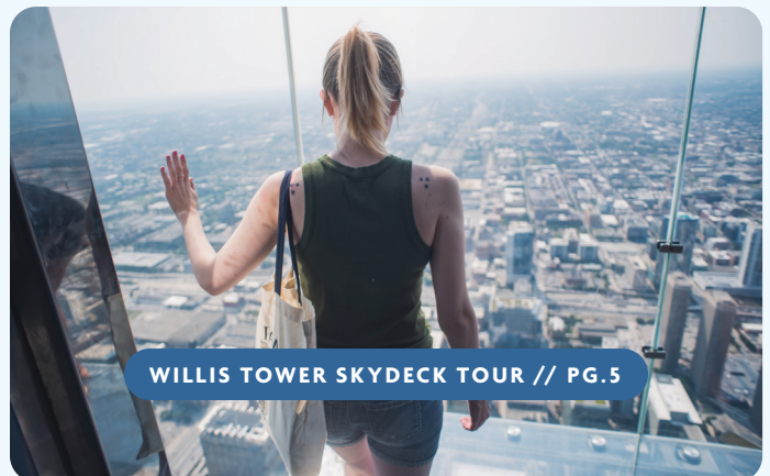
WILLIS TOWER SKYDECK TOUR // PG. 5