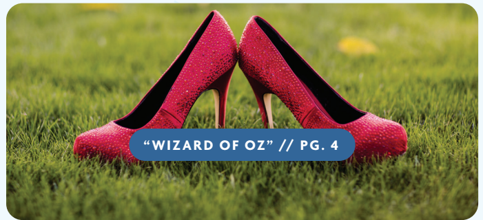
"WIZARD OF OZ" // PG. 4